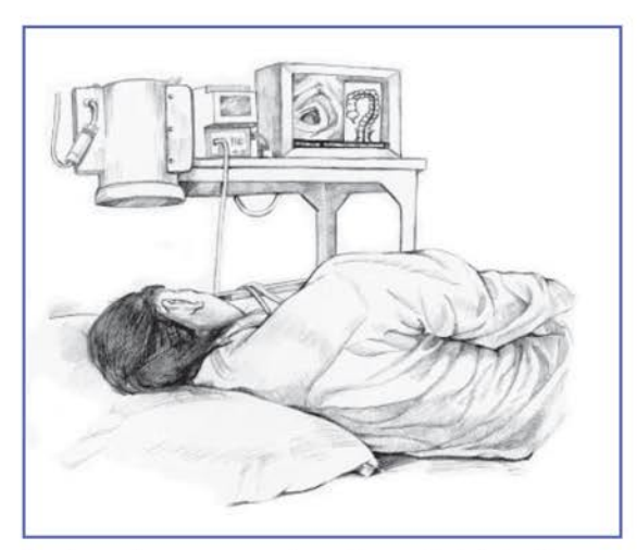
During colonoscopy, patients lie on their left side on an examination table.

During colonoscopy, patients lie on their left side on an examination table. In most cases, a light sedative, and possibly pain medication, helps keep patients relaxed. Deeper sedation may be required in some cases. The doctor and medical staff monitor vital signs and attempt to make patients as comfortable as possible.